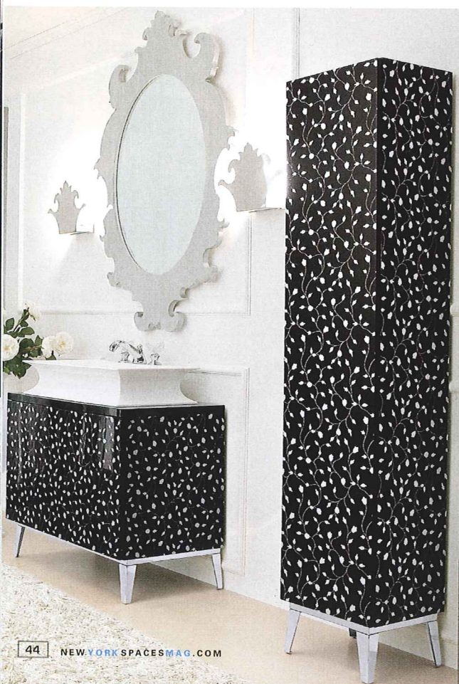
A delicate silver floral pattern embellishes the shining black lacquer bathroom vanity and column cabinet from Nella Vetrina's Hermitage Collection. Available in four sizes and a variety of finishes. nellavetrina.com