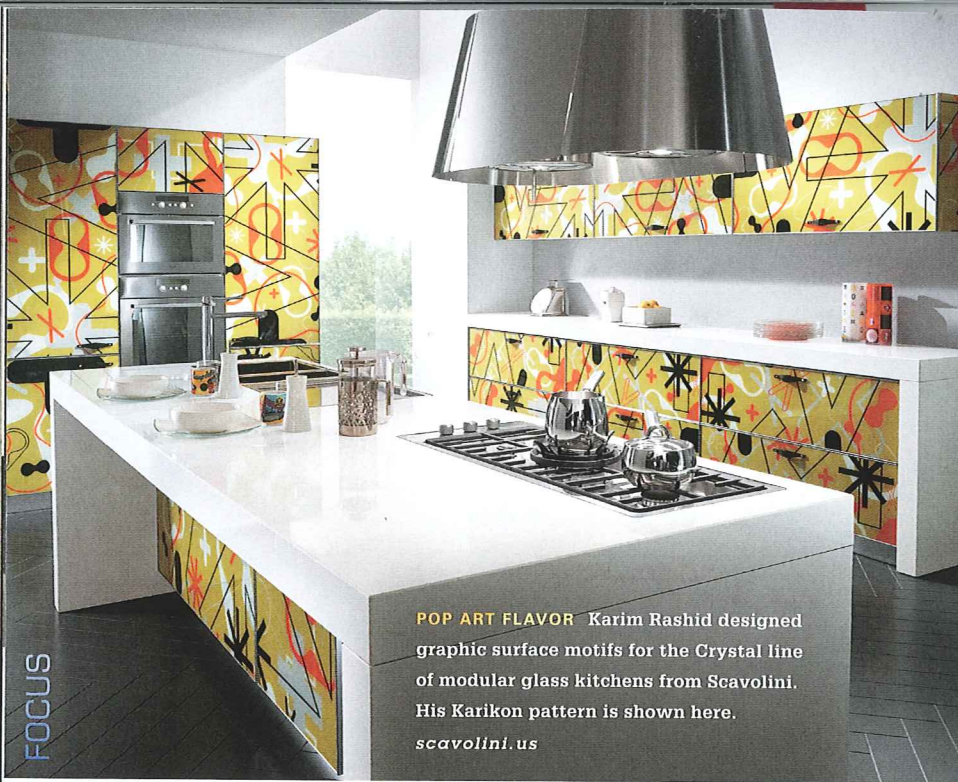
POP ART FLAVOR Karim Rashid designed graphic surface motifs for the Crystal line of modular glass kitchens from Scavolini. His Karikon pattern is shown here. scavolini.us